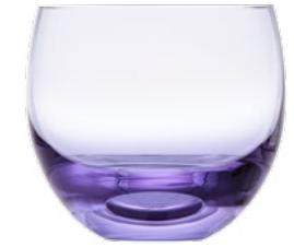
tumbler / alexandrite 340 ml / 9,2×9 cm 11.49 oz / 3.6×3.5 inch 16521