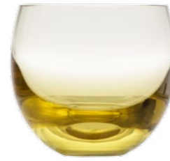
tumbler / eldor 340 ml / 9,2×9 cm 11.49 oz / 3.6×3.5 inch 16521

The basic clear collection best sets off the colour of your favourite drink, but it can be brilliantly combined with coloured variations. At parties you can let your guests choose the colour they like best.