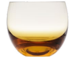
tumbler / topaz 340 ml / 9,2×9 cm 11.49 oz / 3.6×3.5 inch 16521