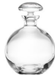
carafe 1000 ml / 5,5×17,1 cm 1 qt. / 2,2×6,7 inch 16530/I