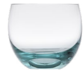
tumbler / beryl 340 ml / 9,2×9 cm 11.49 oz / 3.6×3.5 inch 16521