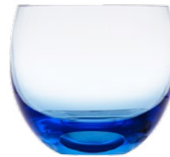
tumbler / aquamarine 340 ml / 9,2×9 cm 11.49 oz / 3.6×3.5 inch 16521