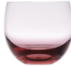
tumbler / rosalin 340 ml / 9,2×9 cm 11.49 oz / 3.6×3.5 inch 16521