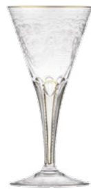
red wine 330 ml / 10,7×21,5 cm 11.15 oz / 4.2×8.5 inch 4401/xx