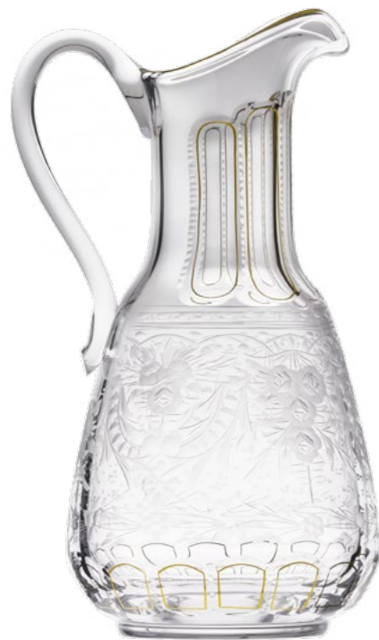
water 1500 ml / 10,9×30,2 cm 1.5 qt. / 4.3×11.9 inch 4419