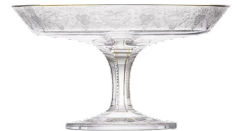
centrepiece 35×18,9 cm 13.8×7.4 inch 4400/N

Capacity (ml/oz) / width × height (cm/inch). The height of decanters without stopper. The width measurements refer to the bottom of the carafes and jugs, to the top edge of all other shapes. Any slight deviations in dimensions or colour are evidence that items are handmade by our master craftsmen. Can be personalised with a coat of arms or monogram. Additional sizes on request. We are available and happy to answer any enquiries for more information.