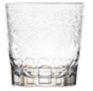
whisky 370 ml / 9,7×10,1 cm 12.51 oz / 3.8×4 inch 4408/O