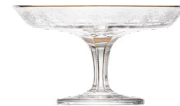
centrepiece 27,8×14,8 cm 10.9×5.8 inch 4400/N