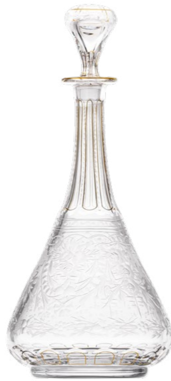
wine 1000 ml / 11×25,4 cm 1 qt. / 4.4×10 inch 4410/1